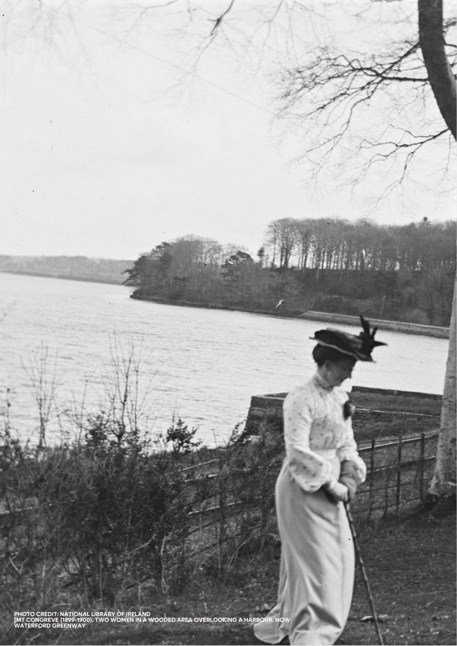
TWO WOMEN IN A WOODED AREA OVERLOOKING A HARBOUR. NOW WATERFORD GREENWAY